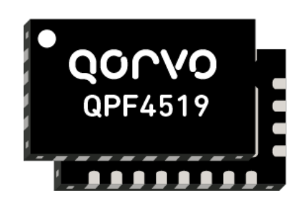
24 Pin 5x3 mm QFN Package